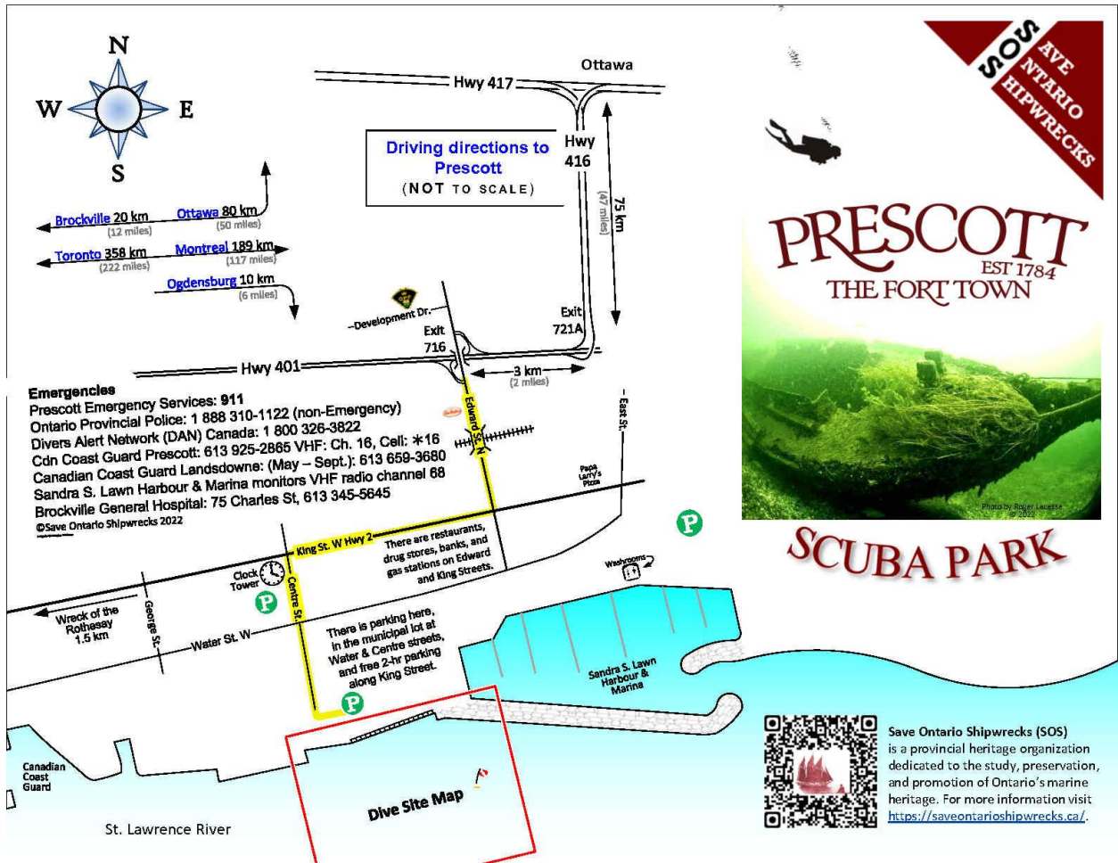
Updated Prescott Scuba Park map – page 1.