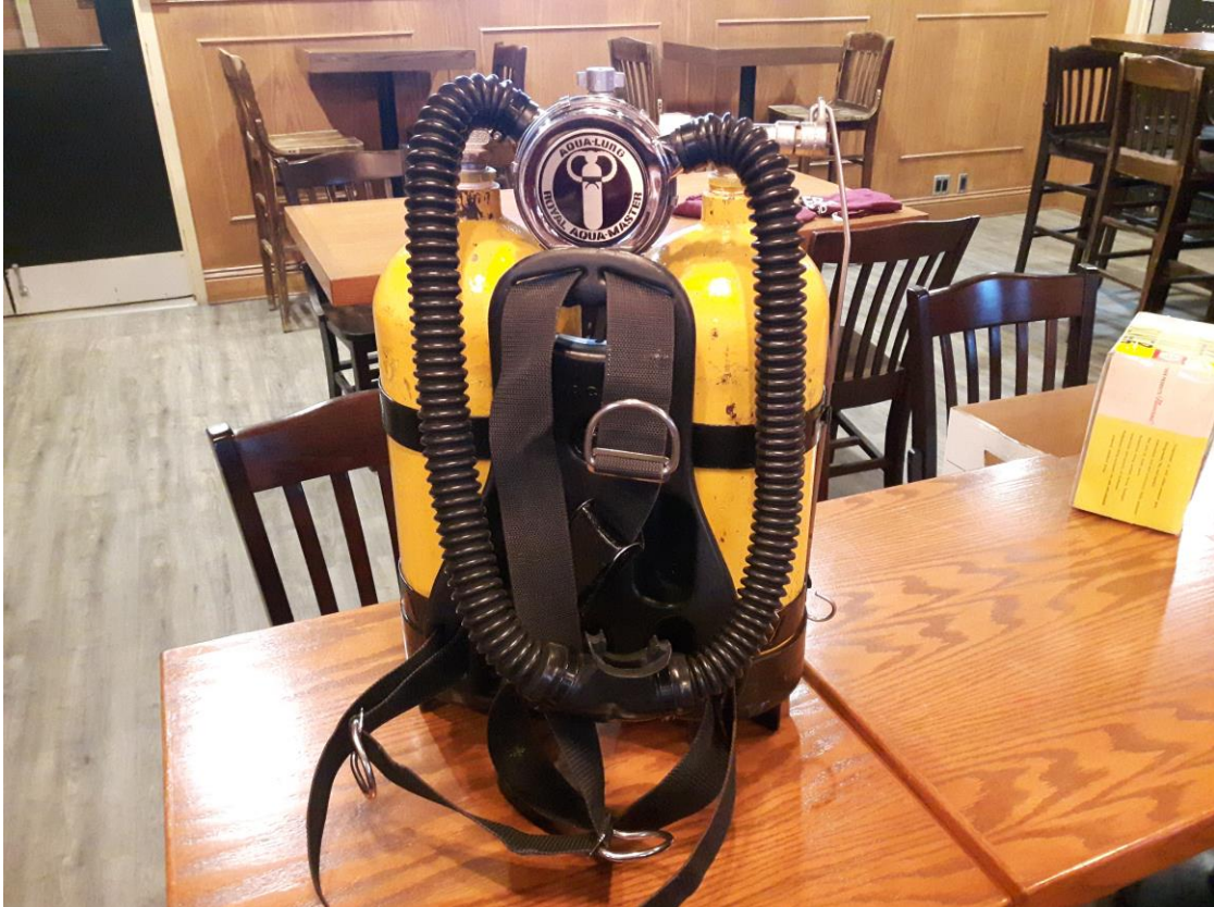
“Beyond the Edge”: A set of vintage twin 38 cu ft tanks.

This month’s selection included a set of twin 38 cu ft vintage tanks (pictured below) with USN letters stamped on side, which may have been former USA aircraft oxygen bottles, and a Nimrod (Spanish) double-hose regulator, model: “Snark III Silver.” New/Vintage Reg including original box! Never used.