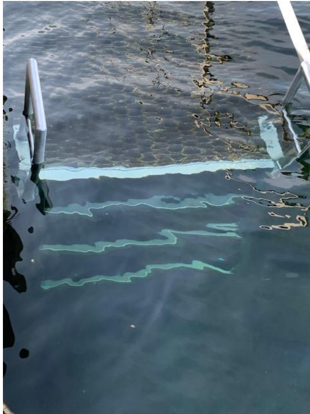
New swim ladder installed on the ramp at the Prescott Scuba Park.